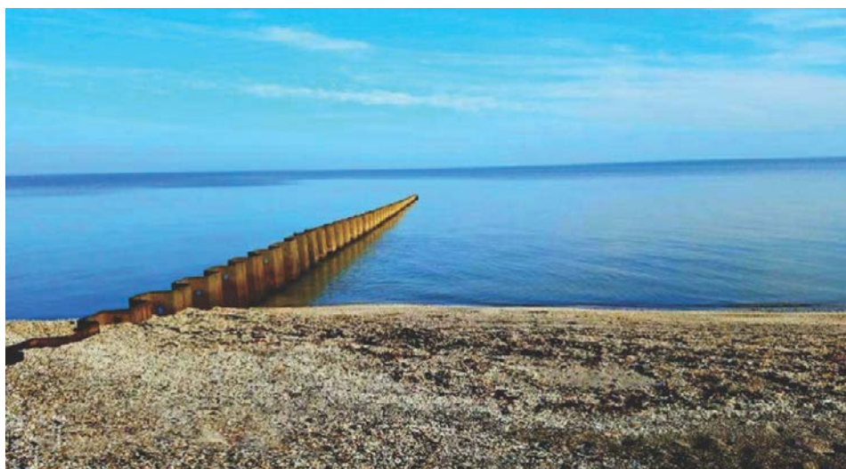
Magee Marsh, Lake Erie

* Notice: by sending your photos, you are giving us permission to use the image online and/or in print promotions for the Land to Lake initiative.