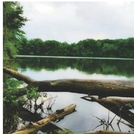
Oxbow Lake

State Nature Preserve covers 321 acres in Fulton County and features some of the largest trees remaining in the state.