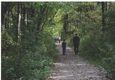
Tow Path Trail