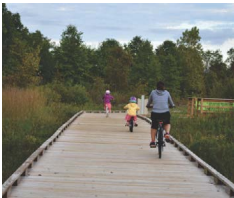
Reservoir Trail